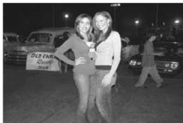
...continued on Page 8